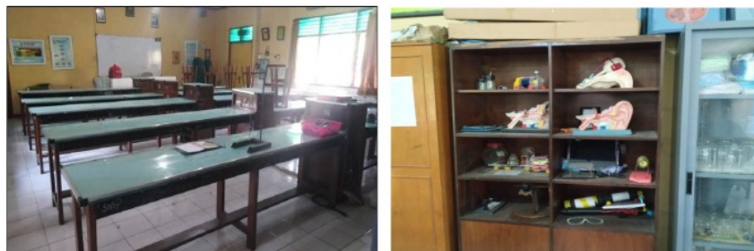
Figure 4. Laboratory in high school; practicum room ( left ), preparation room ( right ).

The results of taking photographs of physics laboratories in schools include: (1) students report the results of taking pictures that contain meaningful images, which tells the physics laboratory equipment in high school, (2) make identification of laboratory physics tools, (3) identification includes the type of practicum that can be done with these tools, any physical concepts related to laboratory equipment in the school, the frequency of use of laboratory equipment, (4) students make interpretation of the suitability of existing tools with the achievement of basic competence of knowledge (BC. 3) and basic competence of skills (BC. 4) in school.