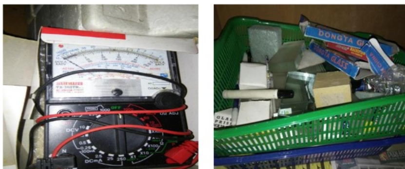
Figure 6. Part of laboratory (Tools); Multimeter (left), optical tools (right).

Based on the study, students are able to use their knowledge to make good judgments, suggestions and decisions on how to manage a good lab.