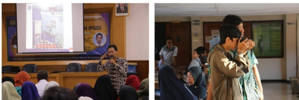
Figure 2. Focus Group Discussion (FGD); the photography expert share the best practice of taking a picture (left), implementation of photography training (right).