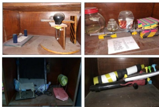
Figure 5. Props that can't be used; optic (upper-left), fluid (upper-right), heat (bottom-left), and sound (bottom-right).