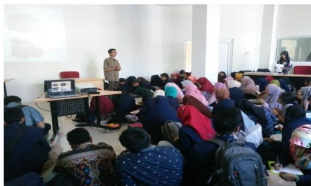
Figure 1. Preparation before Focus Group Discussion (FGD).

Provision of photography techniques was carried out before students underwent the school field program, which was in June 2019. The briefing was given by photography experts, namely experts from the State University of Yogyakarta and multimedia experts from the State University of Surabaya, inside Focus Group Discussion (FGD). Material supplies include, shutter settings, lighting settings, ISO settings (picture sharpness), diaphragm settings, frame settings, camera angle settings, series of photo stories (how to sort photos) so that they become a unified whole story.